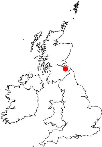
SITE LOCATION - NOT TO SCALE